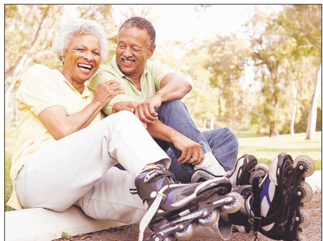
3.34" wide & 2.5" tall Black & White: $30 Color: $40